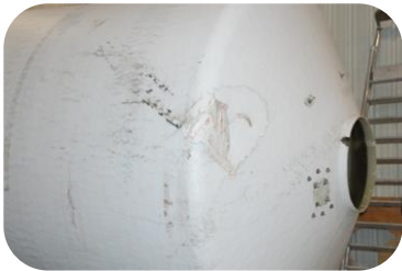
1- Damaged tank